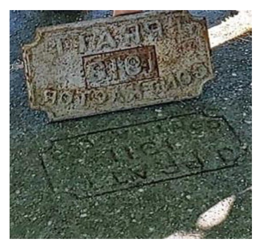
Cast iron stamp 1913, Scott Armstrong collection,